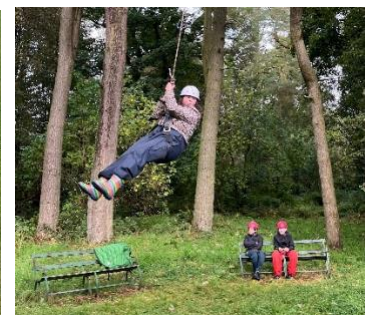
S1 trip to Broomlea