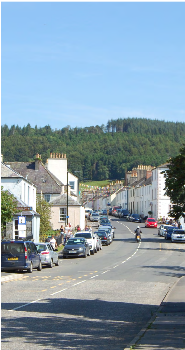
Gatehouse of Fleet

Further copies of this Charter are available on the Council's website at www.dumgal.gov.uk