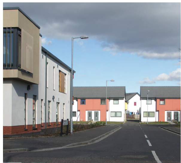
Dumfries housing development